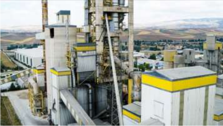
Image 1: The completely enclosed VecoBelt conveys material over long distances while protecting it from environmental influences. It can overcome inclines of up to 18°.