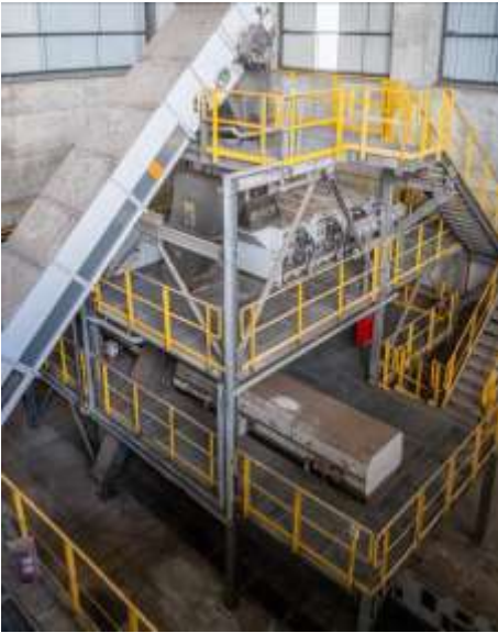
Image 4: A drum magnet extracts ferrous impurities from the mass. Following this process, the RDF passes through a disc screen to separate particles larger than 70 mm. The material is then transported on to a belt weigher.