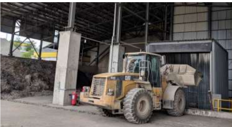
Image 3: The RDF can also be delivered to the reception station by a wheel loader.