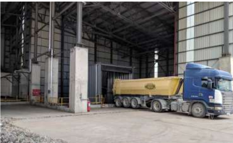
Image 2: A truck unloads RDF at a reception station with a capacity of approximately 100 m 3 .