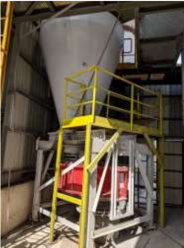
Image 6: The gravimetric dosing system ensures constant, uniform feeding of the preheater.